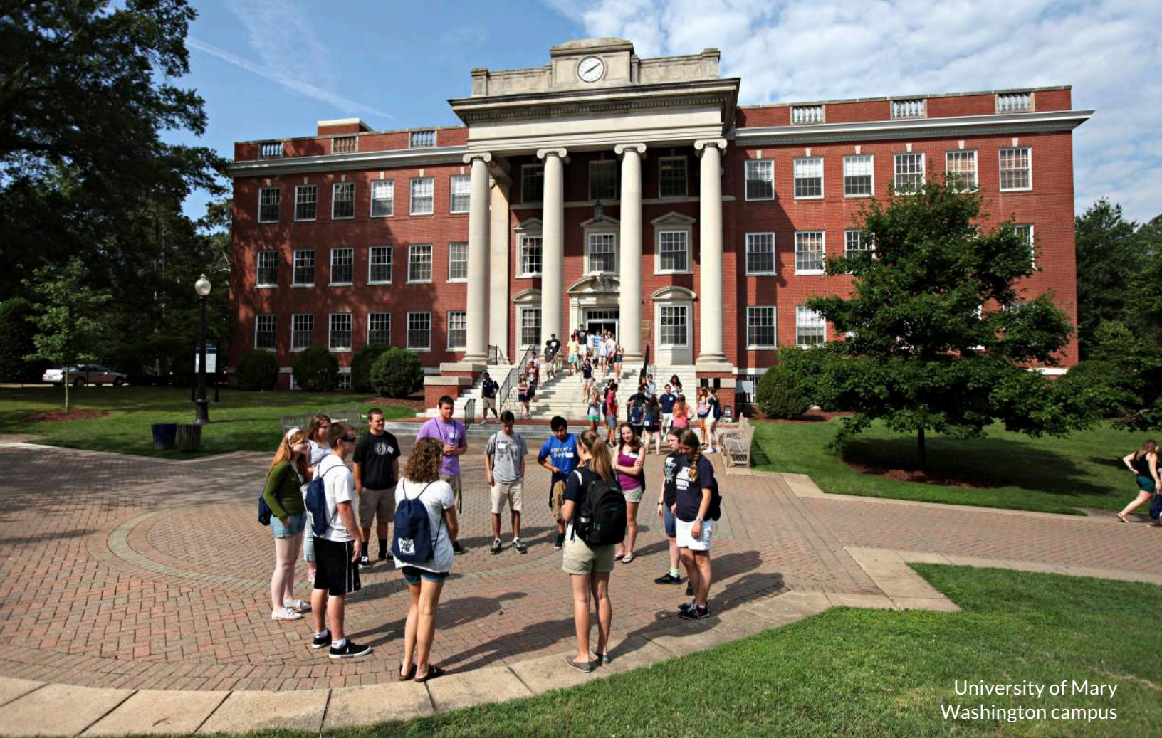
University of Mary Washington campus